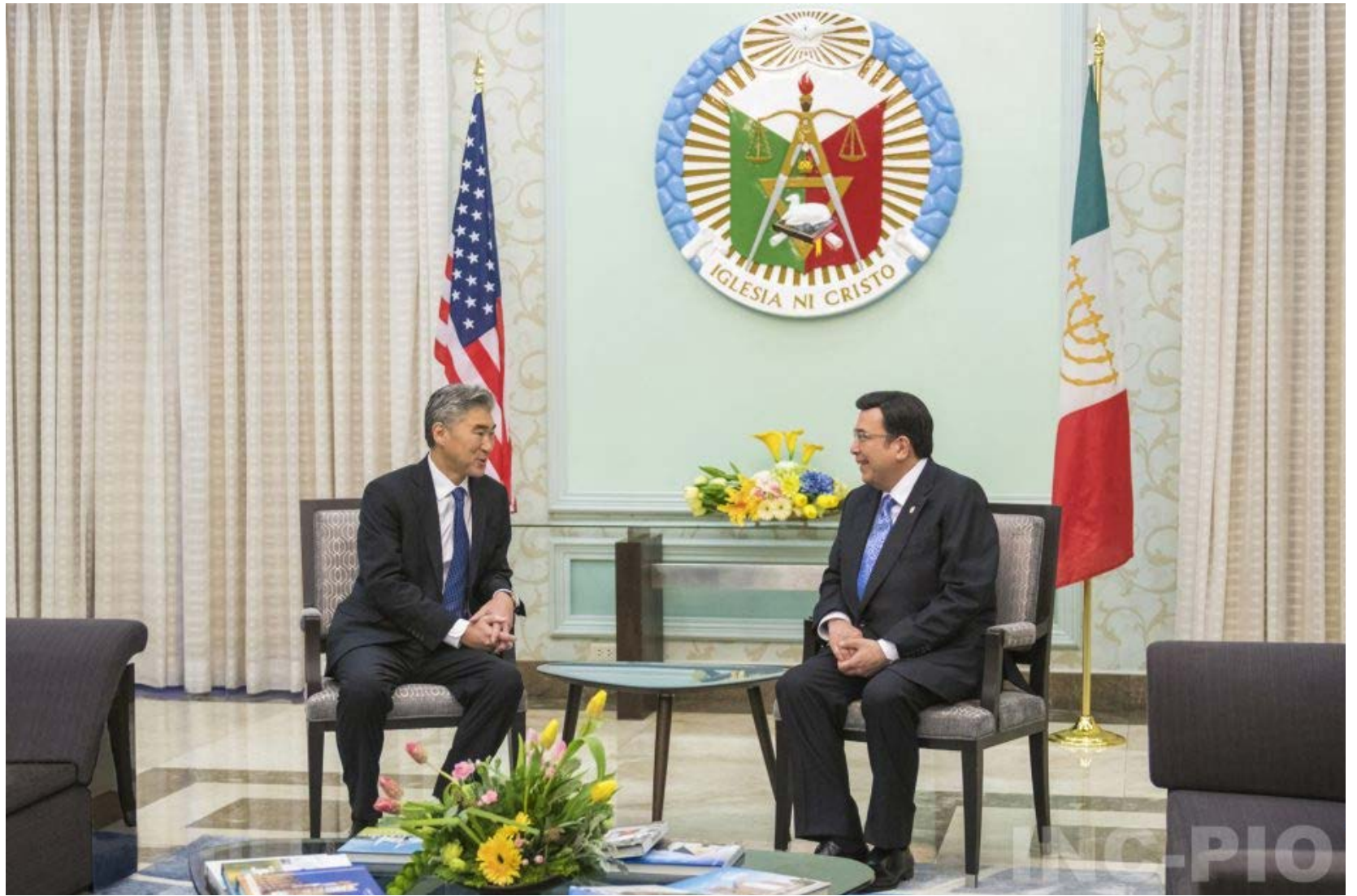
US ambassador to the Philippines Sung Kim, accompanied by Iglesia Ni Cristo Executive Minister Brother Eduardo V. Manalo, is cheerfully greeted and welcomed by ministers and volunteer workers at the INC Central Office. The US Ambassador visited the INC Executive Minister on Monday, February 12, 2018 at the INC Central Office in Quezon City, Philippines.

After his visit, the US ambassador, accompanied by Brother Eduardo, was cheerfully greeted and welcomed by several ministers and volunteer workers at the INC Central Office who excitedly waved small flags of the United States of America and of the INC at the Central Office’s lobby.