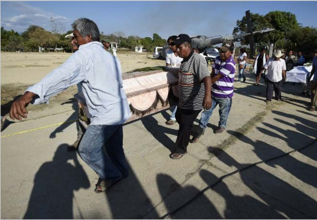
Relatives of thirteen people killed when a military helicopter fell on a van in Santiago Jamiltepec, Oaxaca state, Mexico, carry the coffins of the victims past the site of the accident during the funeral, on February 17, 2018. A 7.2-magnitude earthquake rattled Mexico on Friday, causing little damage but triggering a tragedy when a minister's helicopter crash-landed on the way to the epicenter, Oaxaca, killing thirteen people, including three children, on the ground.