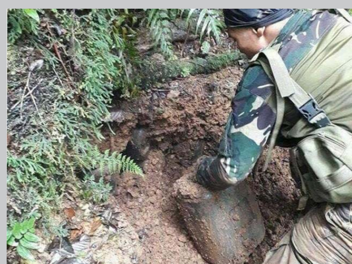
Soldiers from the Infantry Battalion of the Army’s 4th ID unearthed on Wednesday, Feb. 14, supplies allegedly buried by suspected members of the New People’s Army in a forested area in Bukidnon.