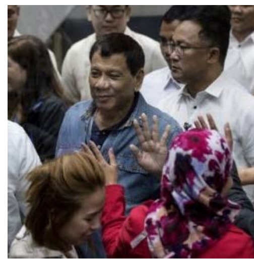
President Rodrigo Duterte

"Balik Manggawa workers who are returning to Kuwait on a new contract with the same employer" are also exempted from the ban, so are "seafarers who will be transiting through or boarding in Kuwait to join their principals."