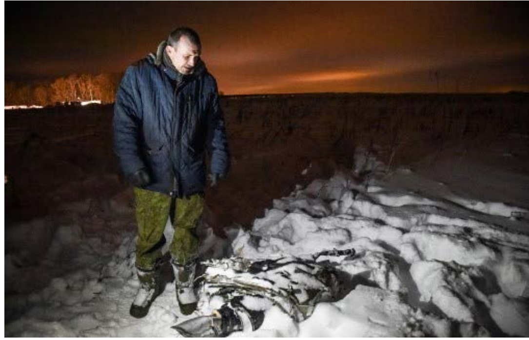
A man looks at debris at the site of plane crash in Ramensky district, on the outskirts of Moscow, on February 11, 2018. A Russian passenger plane carrying 71 people crashed near Moscow on February 11, 2018, minutes after taking off, killing everyone on board in one of the country's worst ever aviation disasters.

The transport investigations office said the plane disappeared from radar screens around