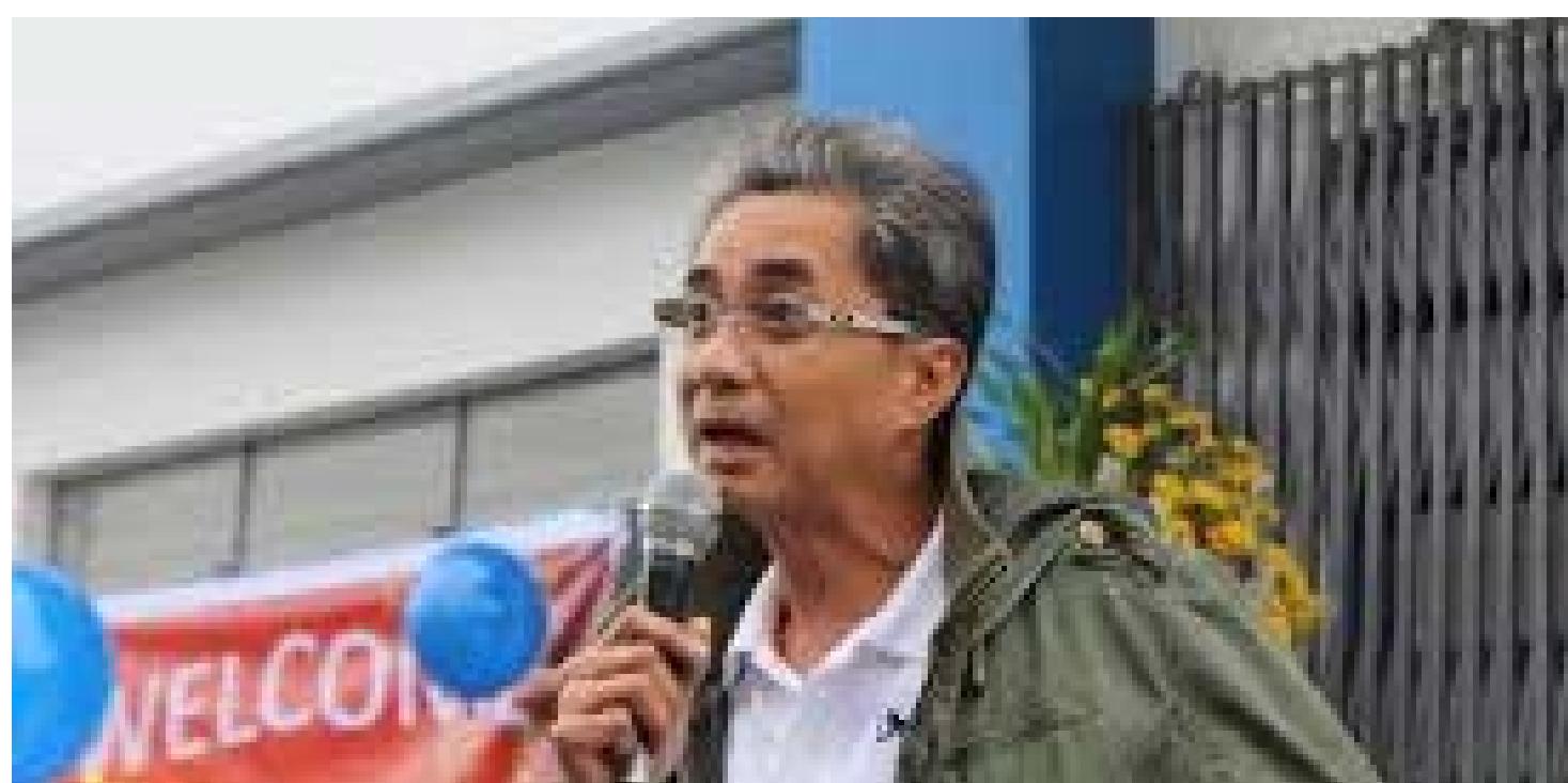
Aurora Governor Gerardo Noveras

The Ombudsman has ordered the suspension of Aurora Governor Gerardo Noveras after he allegedly allowed his own dump trucks to be used in the construction of a barangay project.