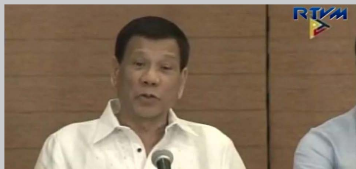
President Rodrigo Duterte speaking during a press conference in Davao City on Friday night, February 9, 2018 where he gave a televised "lecture," explaining Philippine laws, to International Criminal Court prosecutor Fatou Bensouda.

"Now, you decide a case in the international court like a common law," he said. He said the ICC can make a crime out of an act or a deed that would constitute as a crime.