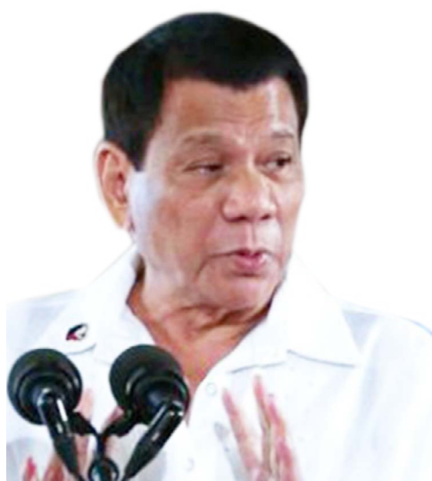
President Rodrigo R. Duterte

Roque said that it is this vast network of the INC across the globe through its members spread in 142 countries worldwide that the Philippine government