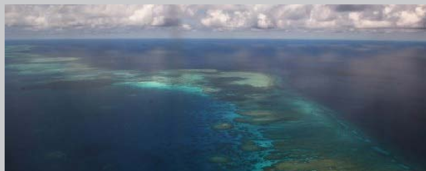
This photo taken on April 21, 2017 shows an aerial shot of part of a reef in the disputed South China Sea on April 21, 2017.

tonomous” ship technology, still in its infancy, would allow both civilian and military craft to be remotely controlled.