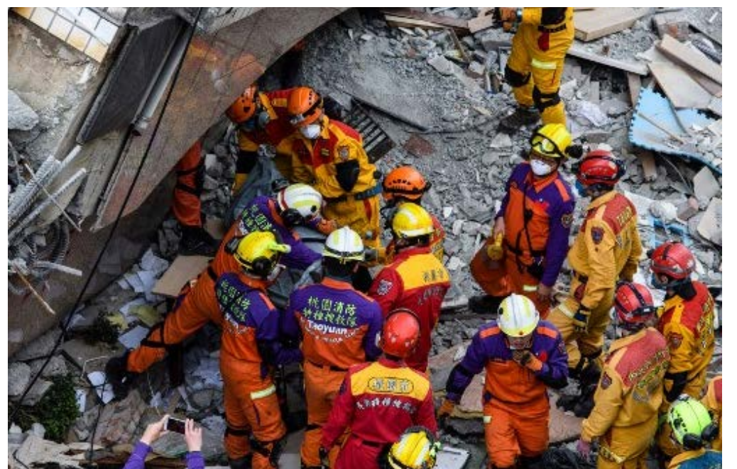
The second of two bodies is removed from the Yun Tsui building, which is leaning at a precarious angle, in the Taiwanese city of Hualien on February 9, 2018, after the city was hit by a 6.4-magnitude quake late on February 6. Taiwan began demolishing three dangerously damaged buildings on February 9 as rescue workers combed the rubble of a hotel in a last-ditch effort to find seven people still missing after a deadly earthquake.

That quake ushered in stricter building codes but many of Taiwan's older buildings remain perilously vulnerable to even moderate tremors. (Agence France-Presse)