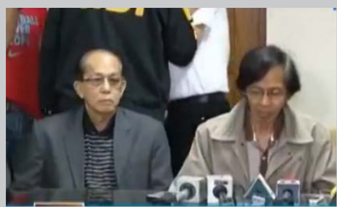
File photo of Jovito Palparan (right)

The National Union of People’s Lawyers said retired Major General Jovito Palparan Jr. “self-destructed” in his last court hearing on the kidnapping and serious illegal detention charges filed against him.