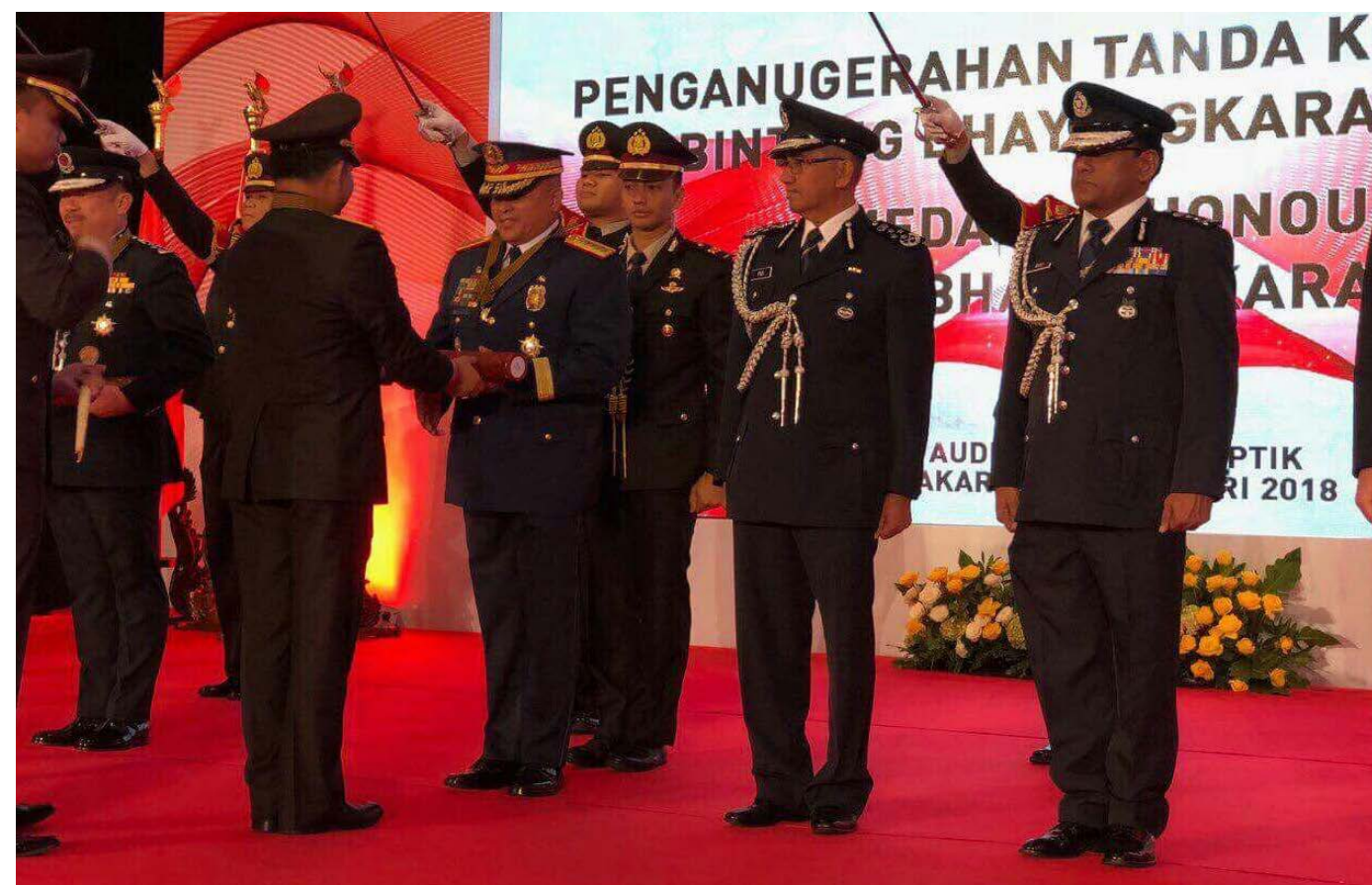
Philippine National Police Chief Ronald dela Rosa receives the Medal of Honor from the Indonesian Police.

The Indonesian police has conferred Philippine National Police Chief Ronald dela Rosa with the nation's highest award given to security authorities.