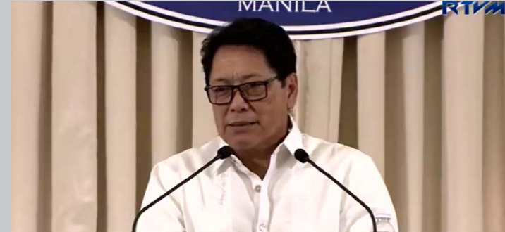
Labor Secretary Silvestre Bello III

Presidential Spokesperson Harry Roque earlier acknowledged this "extensive