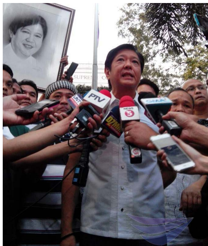
Former senator Ferdinand Marcos Jr., answers reporters' questions as he and his supporters camped out before the Supreme Court on Thursday, February 7, 2018.

"Kaya sila andito (The reason why they are here is) to hold a vigil. But the recount was moved to next month again. This prayer